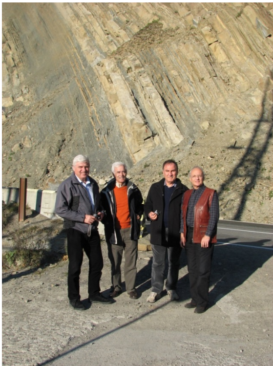
Geological trip Romania 2010: